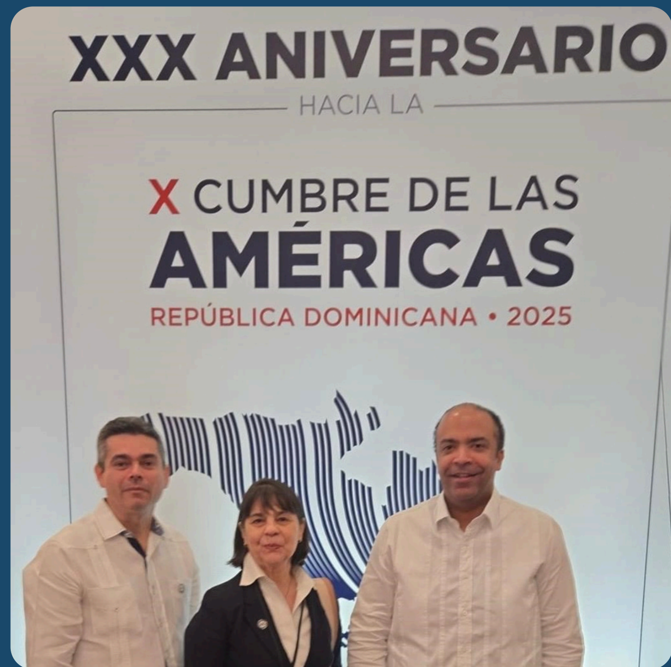
Photo: YABT representative with the CEO of the Banreservas.