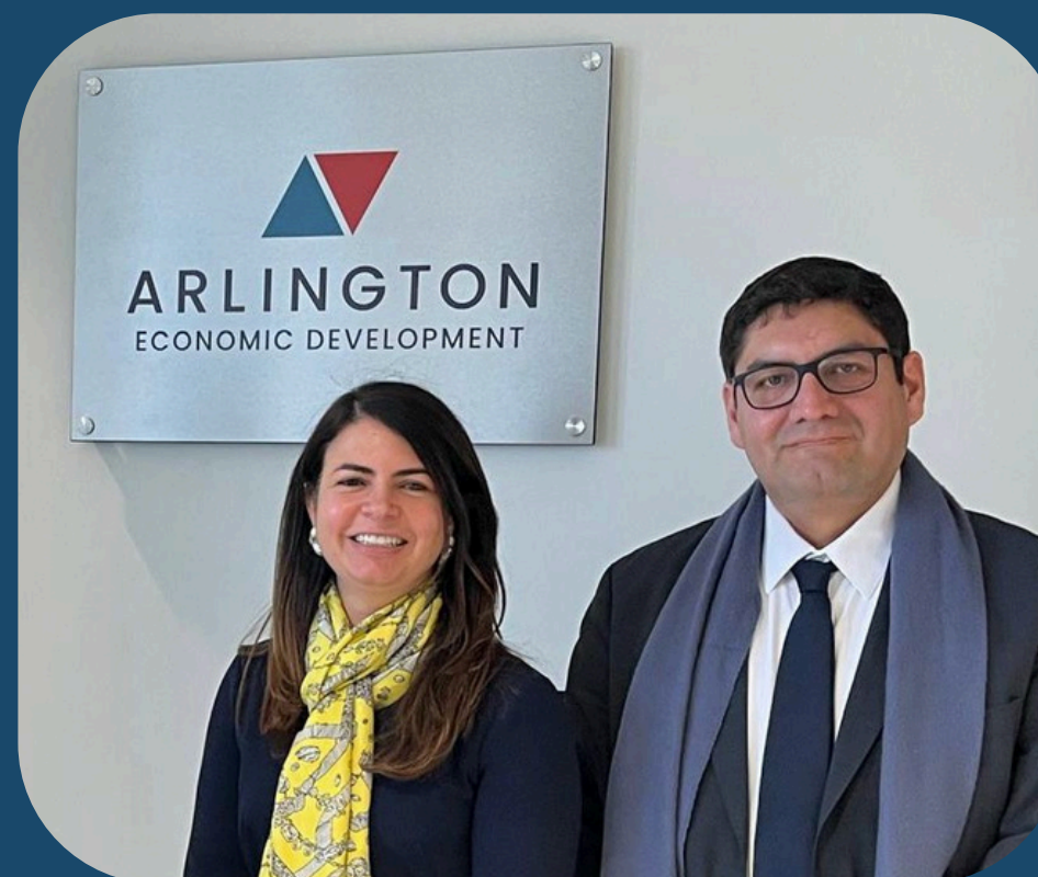
Arlington Economic Development