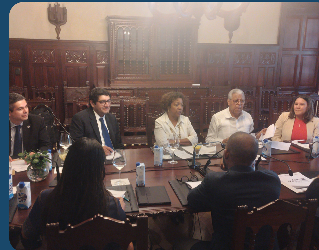
Government of Dominican Republic